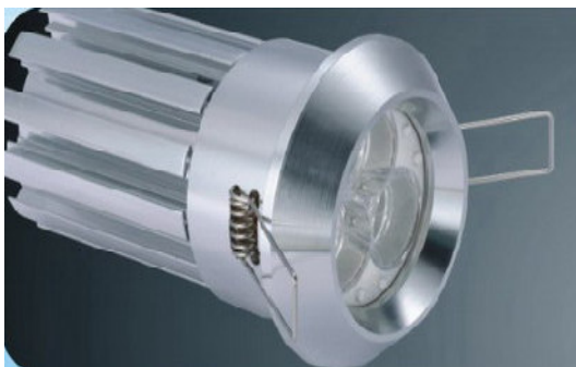
14W Pure White LED Down Light