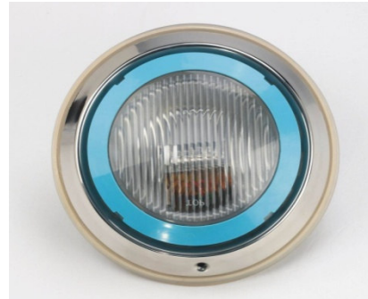
Swim Pool Light