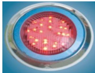
LED RGB Swim Pool Lamp