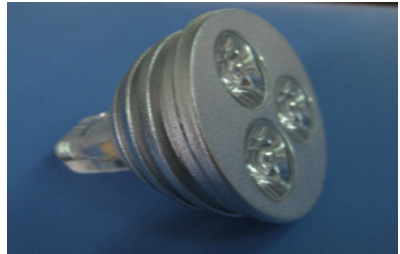
3W White MR16