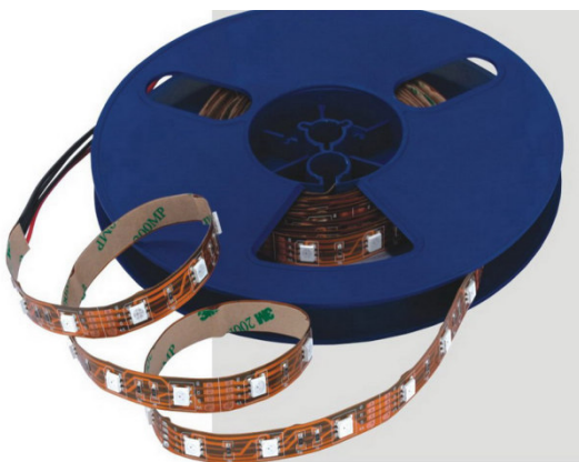
SMD Flexible Strip Light