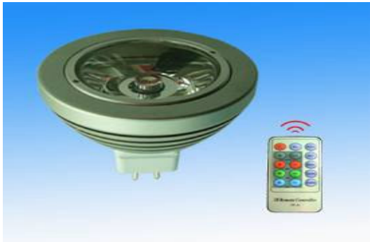
5W RGB MR16