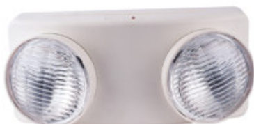
LED Emergency Lamp