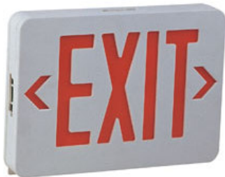
LED EXIT Sign