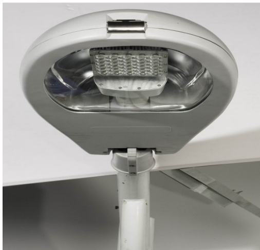
LED Street Light with shield